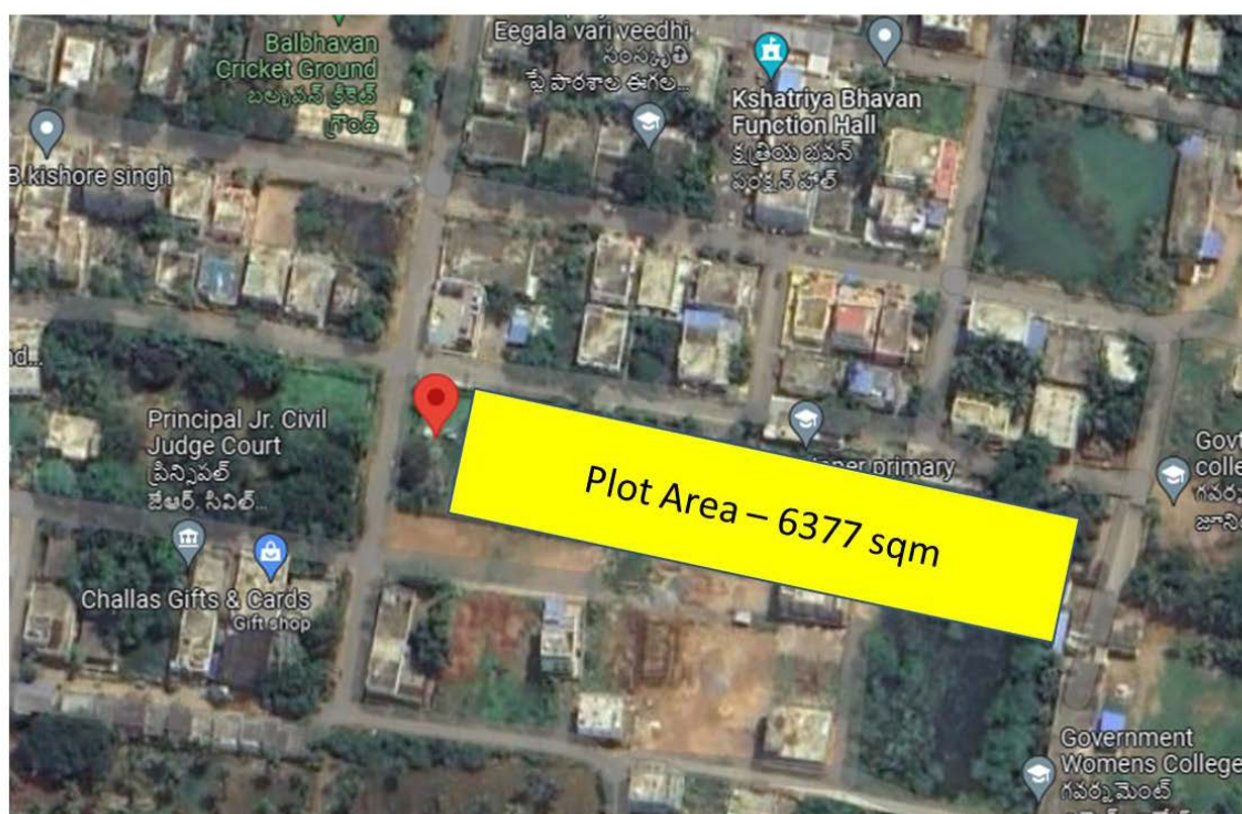
Location of Subject Site

The subject site is situated at 17°21'02.1"N 82°32'38.0"E in close proximity to educational institutions. The site can be accessed by 2 roads. The subject site is located and surrounded by residential colonies. Government Women's College and Upper primary school are near the subject site. A judicial Court is proposed to be developed opposite the site. The subject site is at a distance of approx. 3 Km from NH 16, approx. 4 Km from Tuni RTC Bus Complex, approx. 2.5 km from railway station and approximately 100 Kms from Rajahmundry Airport.